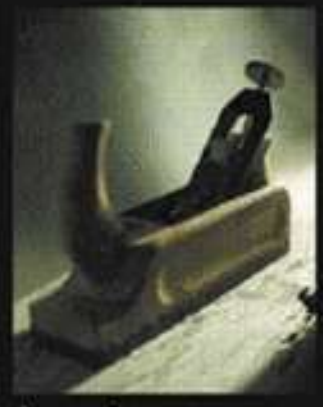
from journeyman to master